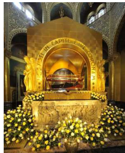
Pictured Above: The Tomb of St. Rita. Cascia, Italy

For the most part, others are open to the idea.